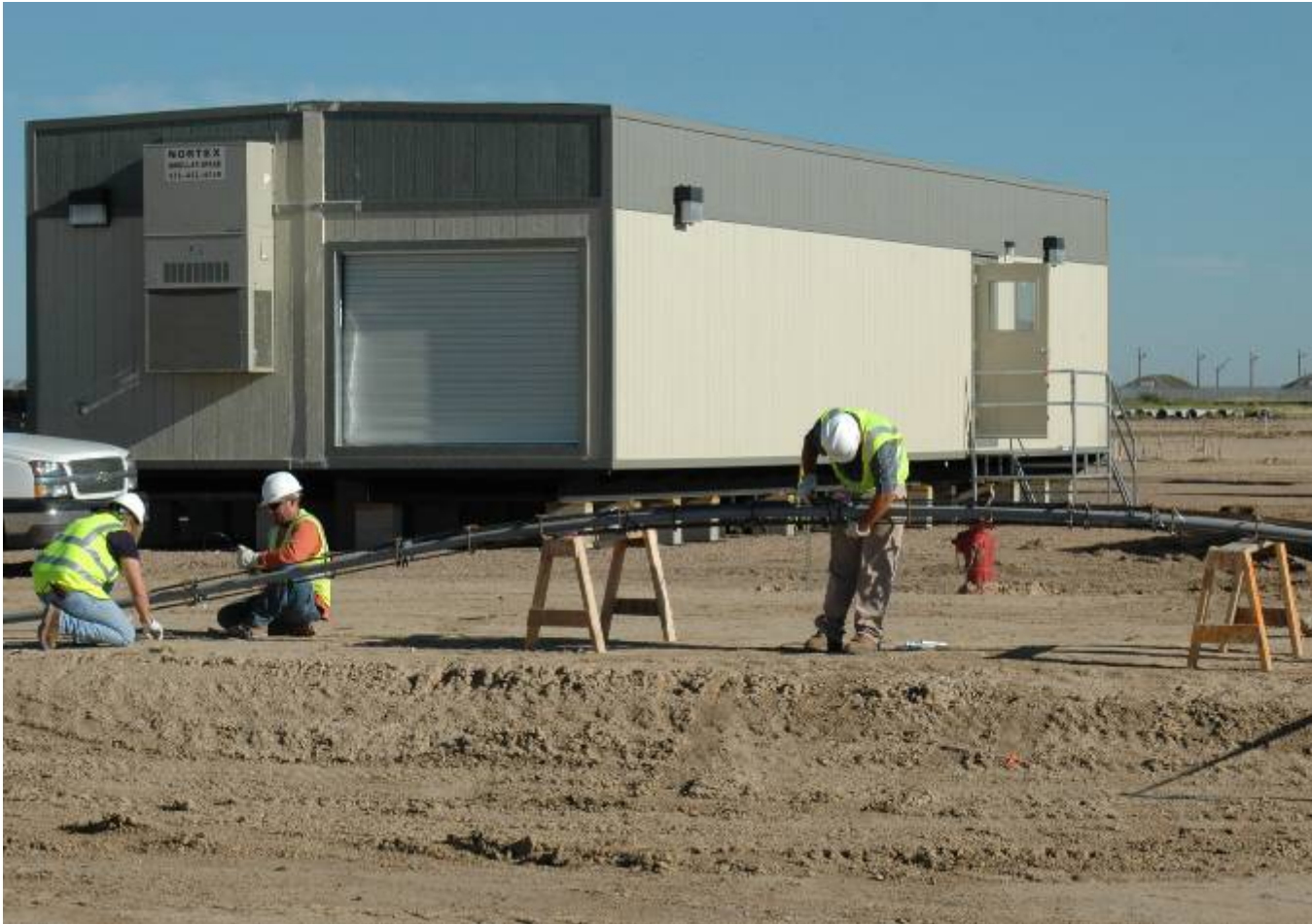
Workers from K. R. Swerdfeger Construction Co. install natural gas piping

A Partnership for Safe Chemical Weapons Destruction