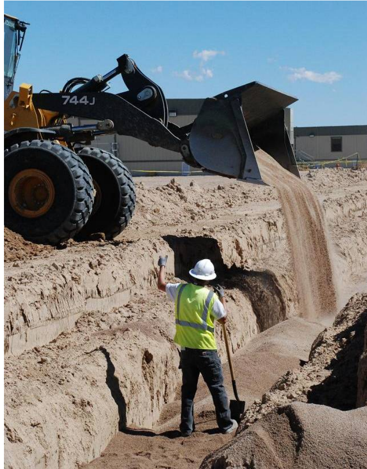
Back-filling the excavation for an underground utilities trench

A Partnership for Safe Chemical Weapons Destruction