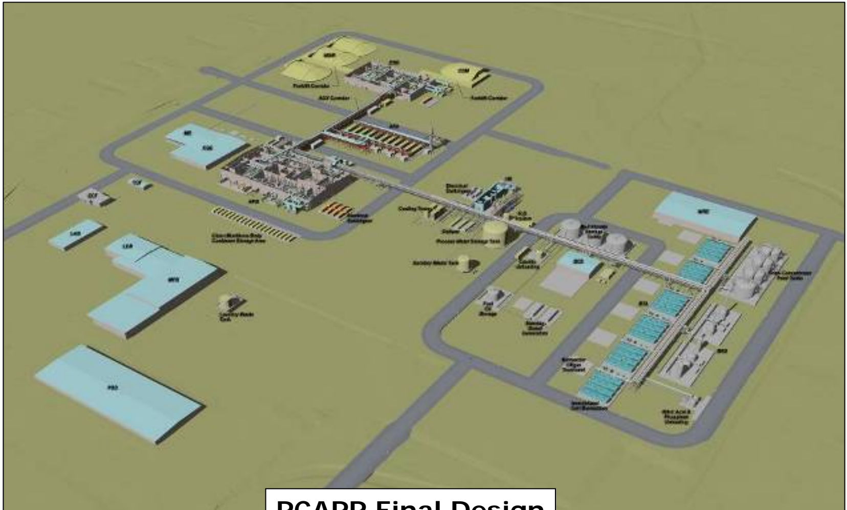
PCAPP Final Design

A Partnership for Safe Chemical Weapons Destruction