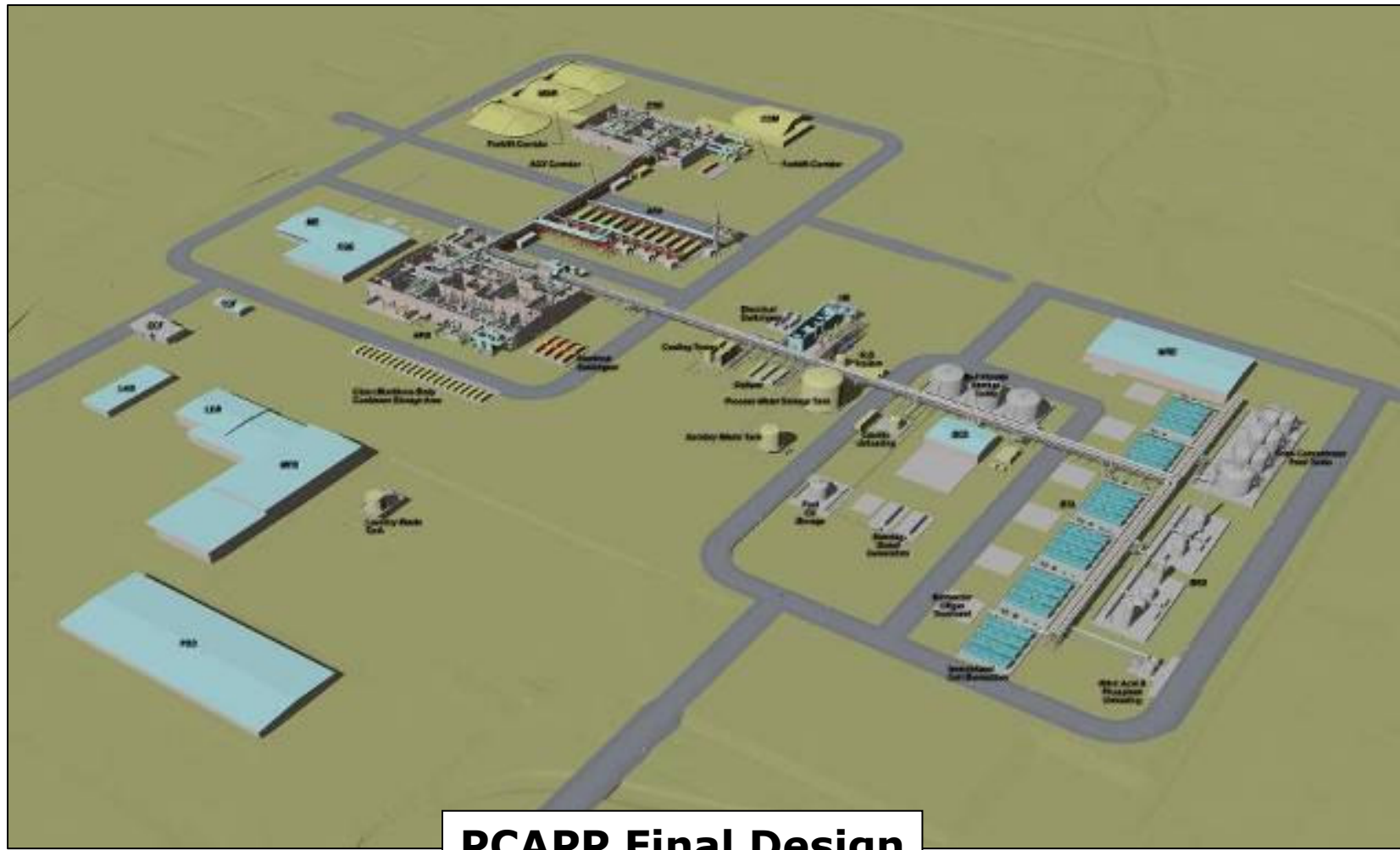
PCAPP Final Design

A Partnership for Safe Chemical Weapons Destruction