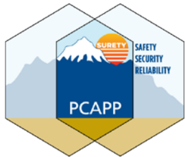
Pueblo Chemical Agent- Destruction Pilot Plant

The Program Executive Officer, Assembled Chemical Weapons Alternatives (ACWA), headquartered at Aberdeen Proving Ground, Maryland, is responsible for managing all aspects of the safe and environmentally sound destruction of the chemical weapons stockpiles in Colorado and Kentucky.