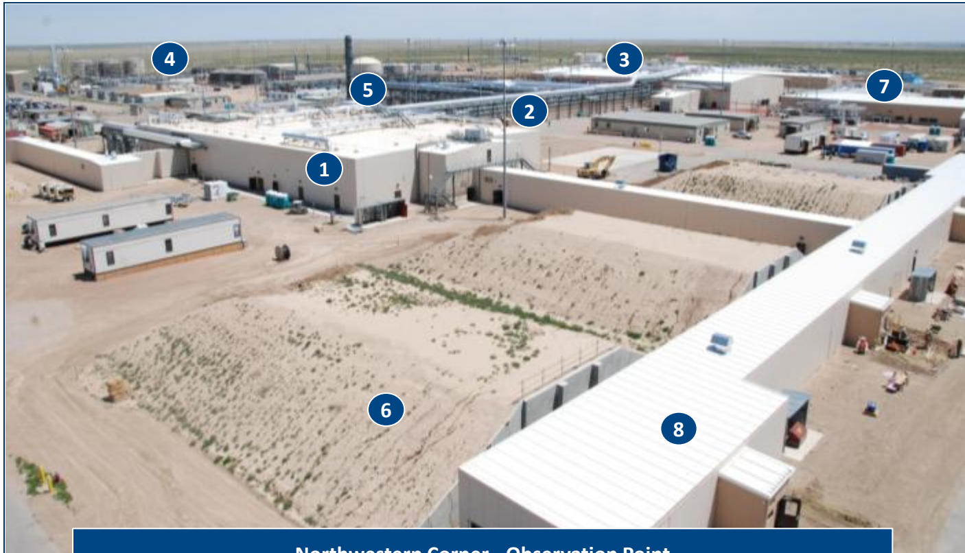
Northwestern Corner - Observation Point