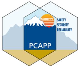
Pueblo Chemical Agent- Destruction Pilot Plant

The Program Executive Officer, Assembled Chemical Weapons Alternatives (ACWA), headquartered at Aberdeen Proving Ground, Maryland, is responsible for managing all aspects of the safe and environmentally sound destruction of the chemical weapons stockpiles in Colorado and Kentucky.