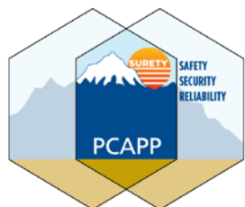
Pueblo Chemical Agent- Destruction Pilot Plant

The Program Executive Officer, Assembled Chemical Weapons Alternatives (ACWA), headquartered at Aberdeen Proving Ground, Maryland, is responsible for managing all aspects of the safe and environmentally sound destruction of the chemical weapons stockpiles in Colorado and Kentucky.